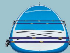
SURF AND PADDLE BOARD CARRIER (1)(2) [TCSUP811]