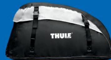
CARGO BAG (1)(2) [82207198 – 311 L (11 cu ft)] [TCINT869 – 481 L (17 cu ft)]