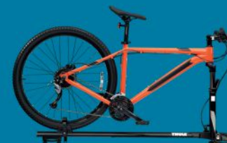
FORK-MOUNT BIKE CARRIER (1)(2) [TCFKM526AB]

Not all part numbers shown. See retailer for additional part numbers by vehicle application.