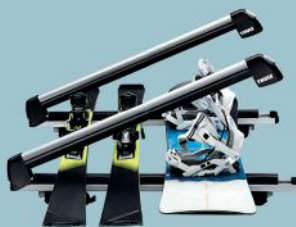
SKI AND SNOWBOARD CARRIER (1)(2) [TCS92725]