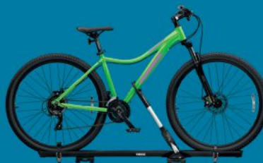
UPRIGHT BIKE CARRIER (1)(2) [TCOES599]