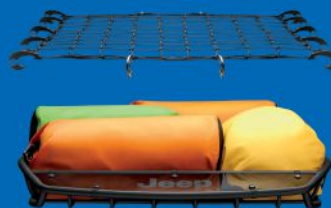
CARGO BASKET (1)(2) [TCCAN859] CARGO BASKET NET (3) [82209422AB]