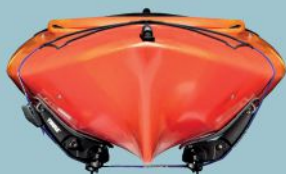
KAYAK CARRIER (1)(2) [TCKAY883]