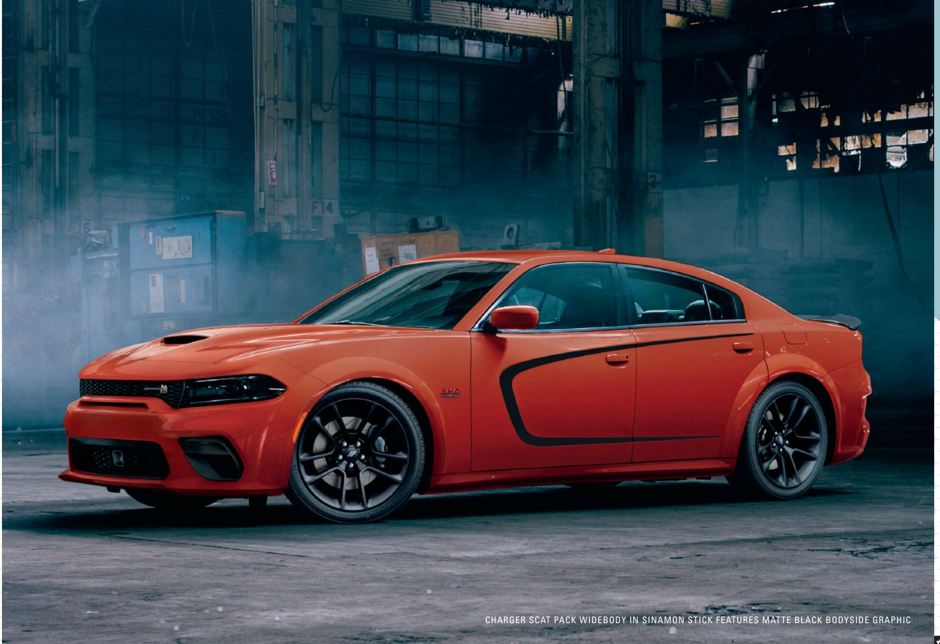
CHARGER SCAT PACK WIDEBODY IN SINAMON STICK FEATURES MATTE BLACK BODYSIDE GRAPHIC