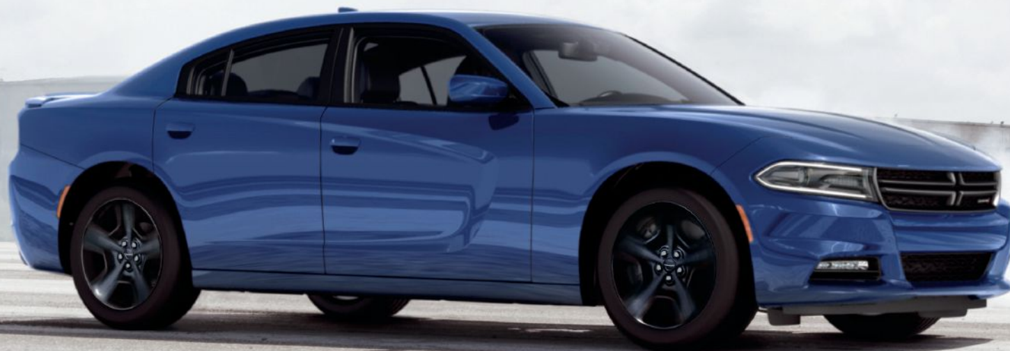
CHARGER SXT IN INDIGO BLUE FEATURES REAR SPOILER, LED FOG LIGHTS (1) AND 20-INCH BLACK ENVY WHEELS

parts for Dodge Charger. The lineup ranges from suspension kits to pad and rotor upgrades to custom wheels machined to match Charger's exact specifications. Regardless of which performance or appearance enhancements you choose, you can rest assured your Charger will command authority.