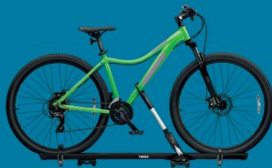
UPRIGHT BIKE CARRIER (1)(2) [TCOES599]