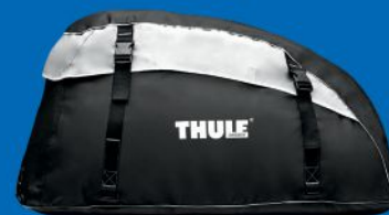
CARGO BAG (1)(2) [TCINT869 – 453 L (16 cu ft)]