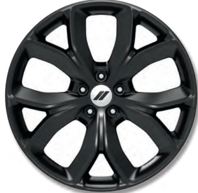
20-inch Abyss Finish // WHN (Included with Track Pack)