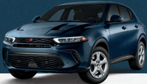
BLUE STEELE (PH6)