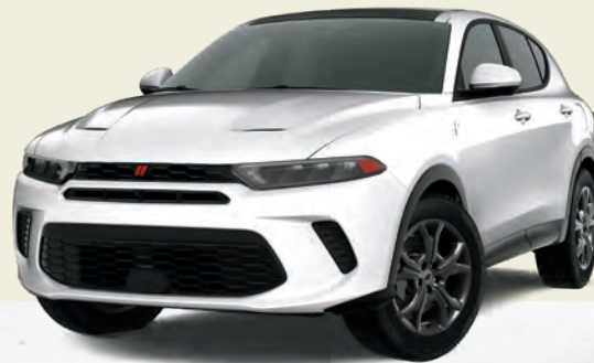
Q BALL (PW1)