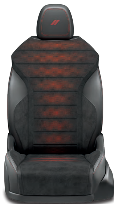
Perforated Alcantara® with Red Backing and Black Scuba Shark Bolsters with Red Accent Stitching (Included with Track Pack in Black)