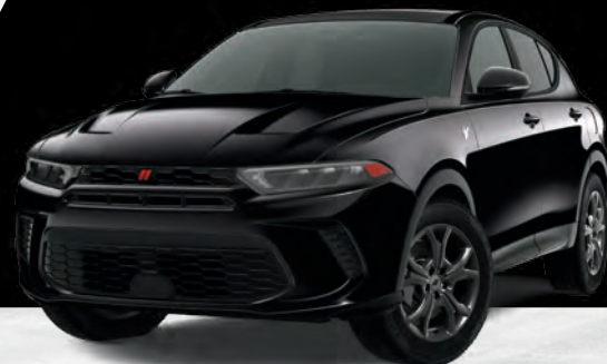
8 BALL (PXN)