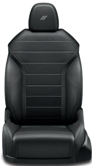
Perforated Leather Trim with Embroidered Dodge Logo and Black Stitching (Standard in Black)