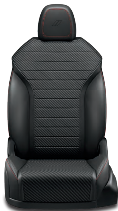
Cloth/Leatherette with Red Accent Stitching (Standard in Black)