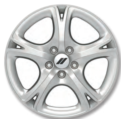
17-inch Silver // WEF (Standard)