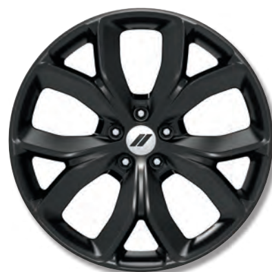
20-inch Abyss Finish // WHN (Included with Track Pack)