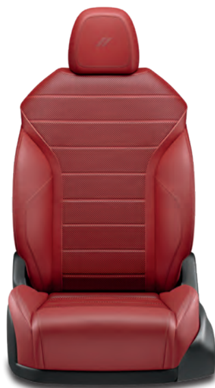
Perforated Leather Trim with Embroidered Dodge Logo and Red Stitching (Available in Red)