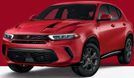
HOT TAMALE (PRR)