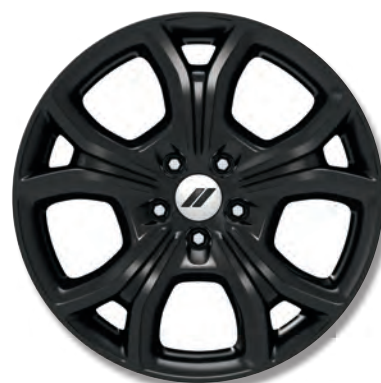
18-inch Abyss Finish // WHG (Included with Blacktop Package)