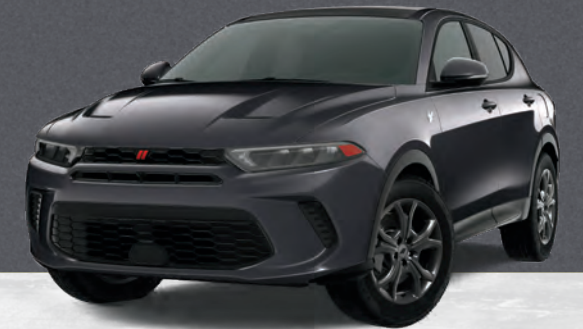
GREY CRAY (PA5)